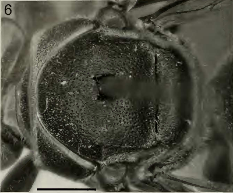
Figs 1-8. Continued.